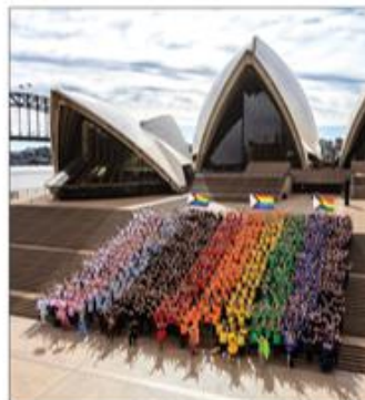
SYDNEY WORLD PRIDE