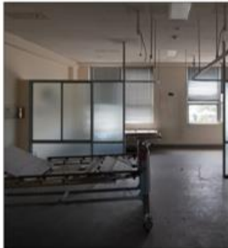
HIV/AIDS PANDEMIC & WARD 17

Qtopia Sydney will host permanent and temporary exhibitions that explore the LGBTQIA+ community through the lens of history, culture, art and contemporary issues. Launching in Sydney for Mardi Gras 2024 the Centre will feature historical and archival objects, imagery, video and audio, to tell some of the stories of this significant period within Australia's history.