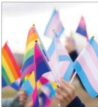
PRIDE ACROSS AUSTRALIA