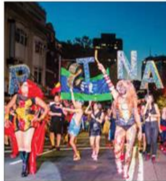
FIRST NATIONS STORIES