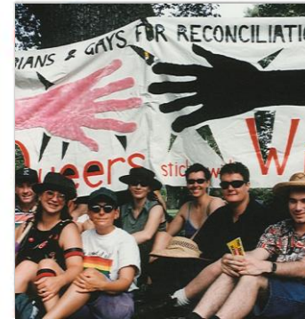
EVOLUTION OF LGBTQIA+ PEOPLES